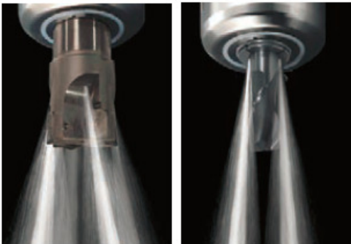
For cutters with coolant hole

Center-through coolant feeding compliant